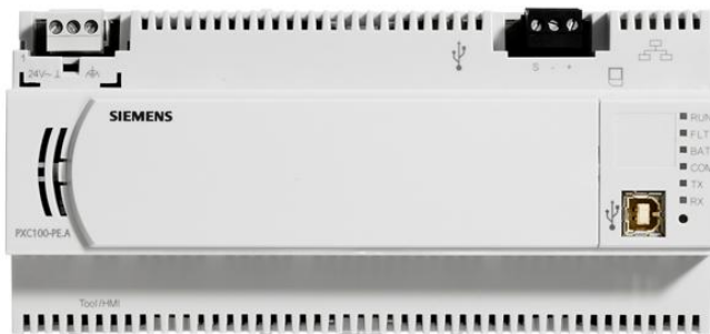
Figure 1. PXC Modular.