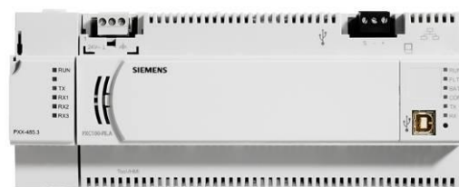
Figure 5. RS-485 Expansion Module and PXC Modular.