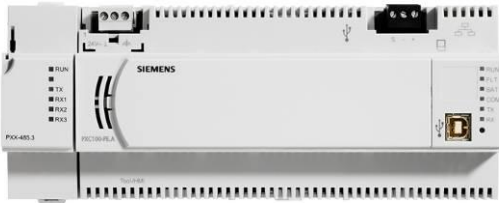
Figure 7. RS-485 Expansion Module and PXC Modular.

Alternately, if no local point control is required, the PXC Modular can be used to monitor and control Field Level Network devices using the Expansion Modules (see Figure 7).